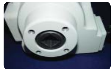
ISO5211 standard drive and mounting design