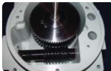
Self Locking worm and gear transmission system