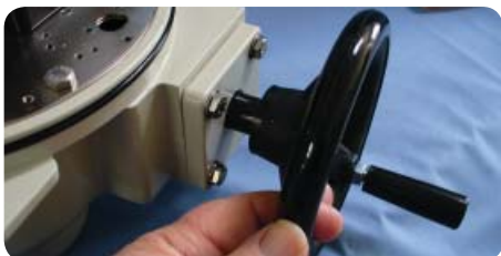
Simple one-handed clutchless manual override system